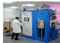
Basic research/research industries

Address:- A/131, Road no. 23, Wagle Industrial Estate, Thane-400 604, Maharashtra, India