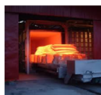
Heat treatment industries