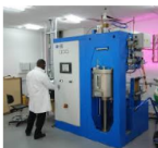
Basic research/research industries