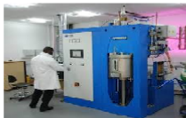
Basic research/ research industries