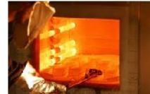
Heat treatment Industries

Address:- A/131, Road No. 23, Wagle Industrial Estate, Thane- 400 604, Maharashtra, India