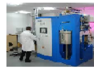
Basic research/ research industries

Address:- A/131, Road no. 23, Wagle Industrial Estate, Thane-400 604, Maharastra, India