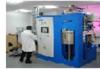
Basic research/research industries

Address:- A/131, Road no. 23, Wagle Industrial Estate, Thane-400 604, Maharashtra, India Tel:- 91 22 25823441/25823442/25812417 Fax:- 91 22 25830540 Email:- contact@therelek.co.in Website:- www.therelek.co.in , www.indiamart.com/ therelek-furnaces