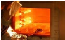
Heat treatment industries